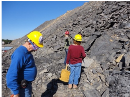
A good time had by all.